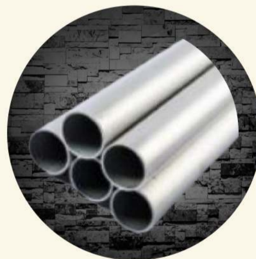
Aluminum Alloy Poles