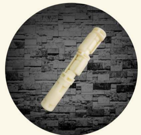
Nylon Locking Device