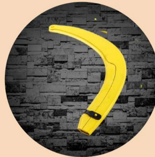
SURESAFE Sickle Cover